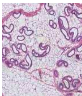
Fat. Without FineFIX