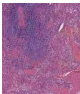
With FineFIX processing