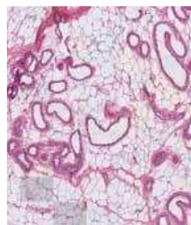
With FineFIX processing