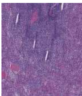
Spleen. Without FineFIX